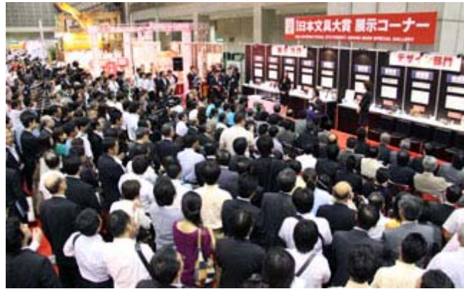
Previous (2009) Award Ceremony

STATIONERY OF THE YEAR has been taking place annually inside ISOT (Organised by Reed Exhibitions Japan Ltd.). It is a contest of selecting and awarding the stationery amongst those released after August 1, 2009 from functional and design perspective. Recently the Award has been producing 'Mega-Hit products' from the winners and it has been perceived as one of the most important event in the industry. It has been gaining great attention not only from the stationery industry but also from variety of media such as magazines and TVs, and consumers. While the Show Management has been receiving numbers of inquiries, the application process has finally started. This is definitely an 'epoch making' contest in the stationery industry. Apply now to open up your business opportunity in Japanese stationery market!